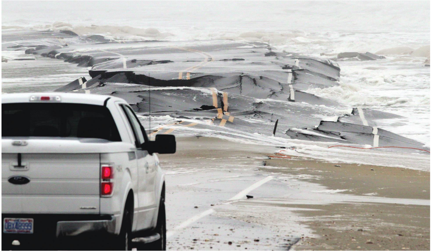
A four-wheel-drive truck slows as it approaches a stretch of coastal road damaged by Hurricane Sandy, Hatteras Island, October 2012.